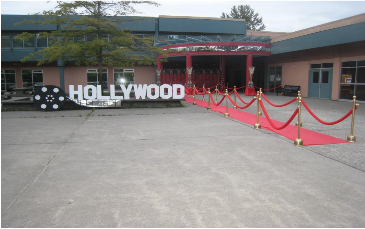
AFTERGRAD ENTRANCE 2017

Over 270 students enjoyed the After Grad (Dry Grad) event held at our school following the Dinner and Dance. The theme for the event was “Hollywood” and a hard working group of parents did a fabulous job decorating the school inside and out. Grads enjoyed a red carpet entrance and were thrilled to find their personalized gold Hollywood stars on the walls inside the building. The parents spent considerable time and effort organizing prizes, food, large blow up activity stations and casino tables, magicians, caricature artists, photo booths, spray on tattoos and much more. Special thank you goes to our After Grad chairs Lisa Cave and Lesia Verones and to all of the committed parents who devoted many hours to create an event for students who were looking for a safe and fun, non-drinking event with friends to cap off a wonderful grad evening.